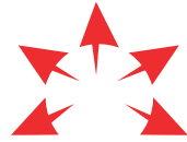
Figure 1: CTN Full Submission Review and Approval Process